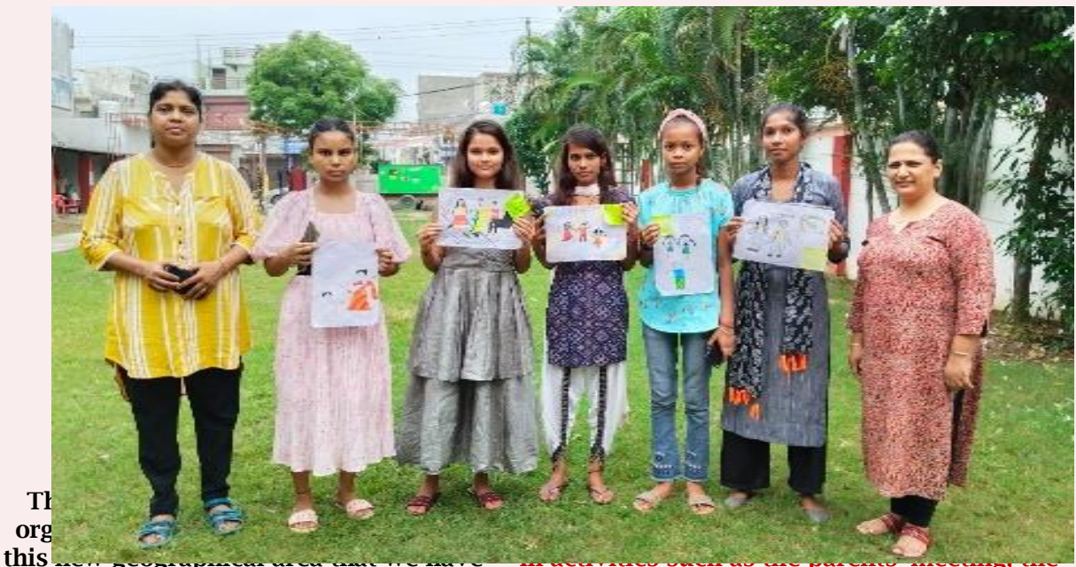
included in our work efforts.